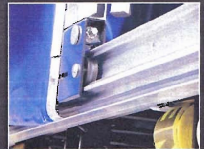
Patented Wheel And Track System

Introducing an all-new easy to operate rolling tarp system for carriers, developed by Aero Industries and Jerr-Dan Corporation. Based on Aero ® Industries Conestoga 2 ® system, the Jerr-Dan rolling tarp system features an innovative design that easily covers and uncovers a carrier deck in seconds. Instead of having to climb over the carrier deck and tie down a tarp, the driver can walk alongside and cover a vehicle in seconds.